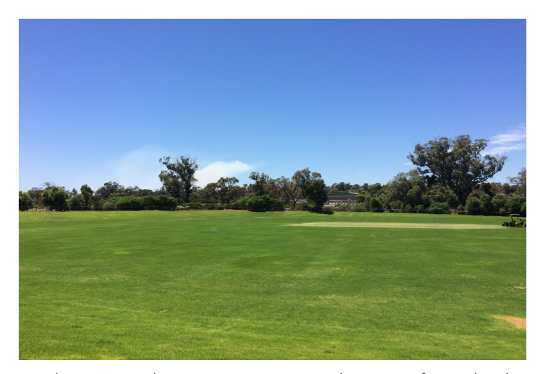
<u>Trial Site - Meadow Springs Sports Facility, City of Mandurah</u>

Soil moisture at 10cm and 20cm was measured by in ground sensors and compared to a control area of the same size and irrigation schedule. The application and control sites were both 2 hectare, irrigated active sporting ovals and were irrigated for 30min per station 5 x per week, with 10mm per irrigation event.