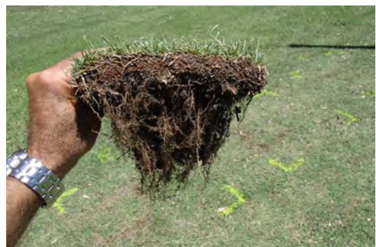
Terra Start 4 months after treatment