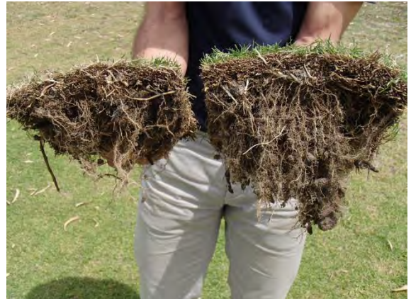
Control (left) vs Terra Start (right)

Visual assessment of the root system was carried out at 6 weeks and 4 months after planting, by removing a block of turf to a depth of approximately 200 mm.