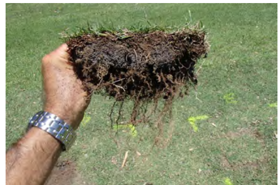
Control 4 months after treatment

Baileys Terra Start showed excellent results for both root growth and turf appearance 6 weeks in and 4 months after treatment. Terra Start gave outstanding root establishment results and was far superior to the untreated control shown in comparison above and below.