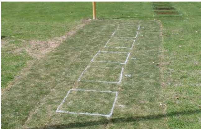
0.6 x 0.6 plots marked out for trial

In October 2014, Sports Turf Technology evaluate the performance of Baileys Terra Start as an underlay treatments in a re-turfing situation. The trial was conducted at Beasley Reserve in the City of Melville, Western Australia. The underlay trial was on newly-laid wintergreen couch, using a plot size of 0.6 x 0.6 metres to match the width of the turf rolls. Baileys Terra Start was incorporated uniformly to a depth of 100 mm.